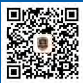
Wechat public account